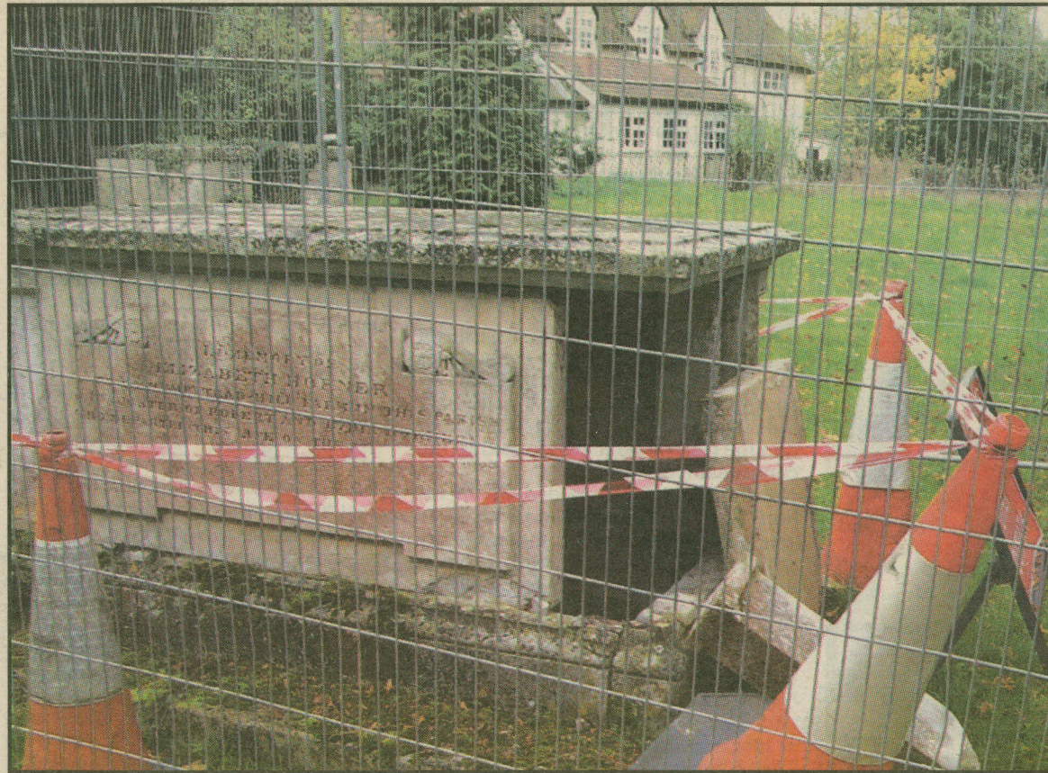
A GRAVE has been desecrated by vandals, who caused £3,000 damage to a tombstone. The 8ft by 3ft tombstone is in St