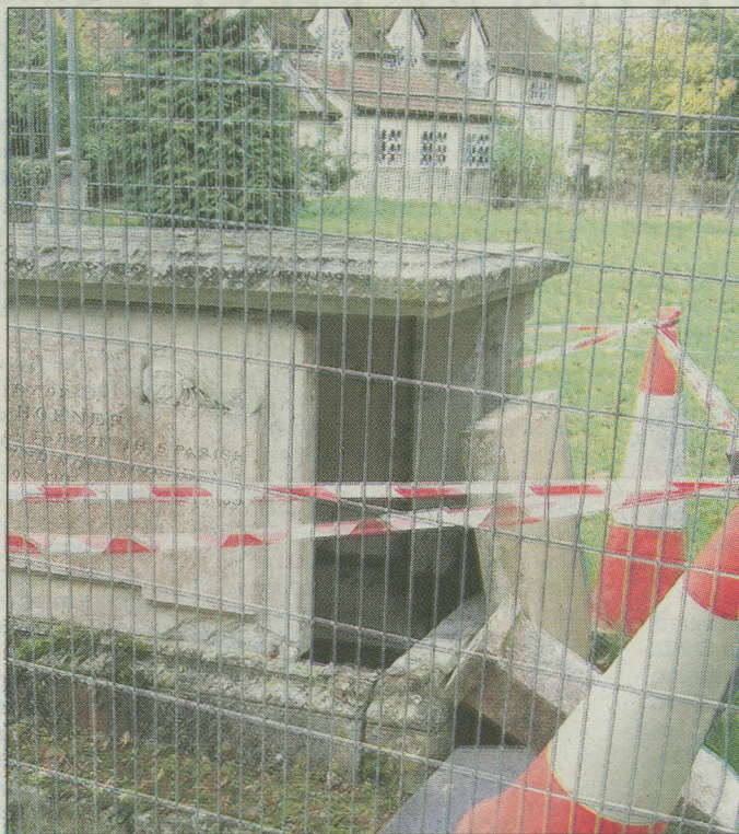
■ THOUGHTLESS VANDALISM.. one of the damaged tombstones in St Andrew's churchyard.

"Whoever did it hurt themselves because there has been blood left behind. There must have been some force used.