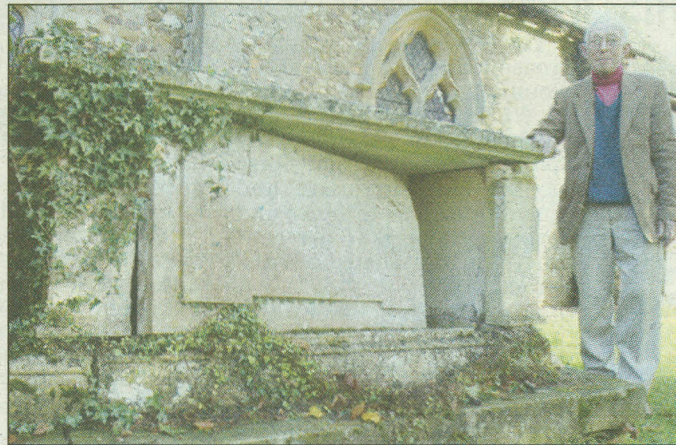
SHOCKED: Churchwarden Alan Weedon with one of the damaged tombs

designed to keep heavy goods vehicles off the rural roads of Uttlesford has been proposed. The plan has been put forward by members of Saffron Walden Town Council.